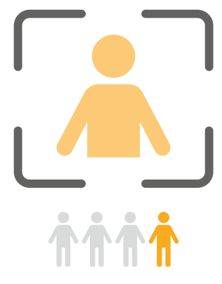
Every 4th young person was asked to send pictures exposing themselves via the Internet against their will

1/5 of young people had been asked online about their intimate body parts or sexual experiences against their will